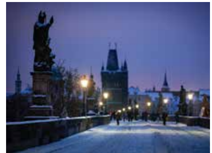
The statue of Augustine of Hippo on the Charles Bridge in Prague

A mystery is a truth of our faith that we can explore, but never fully understand.